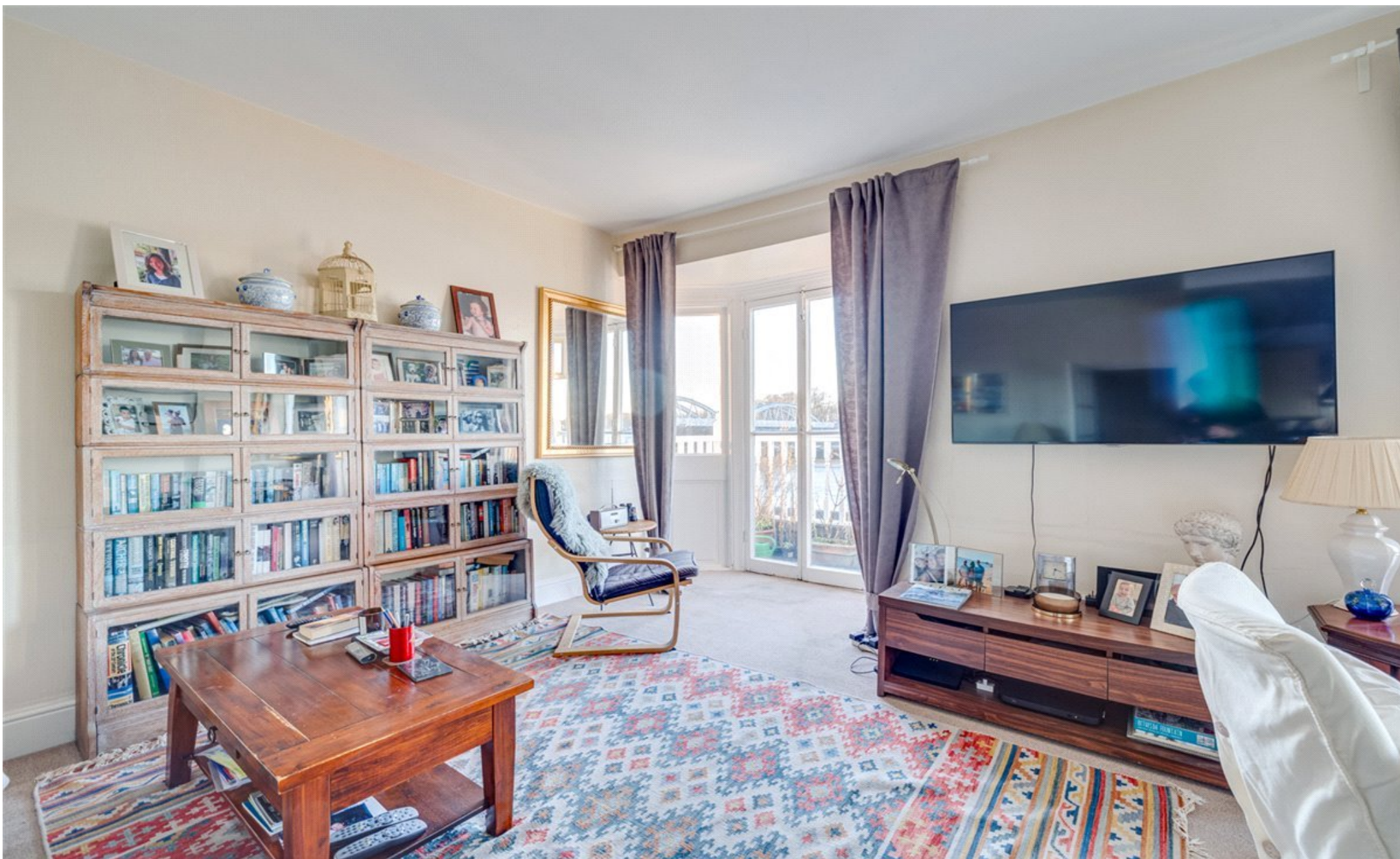
THE TERRACE, LONDON, SW13 £2,300 per month*