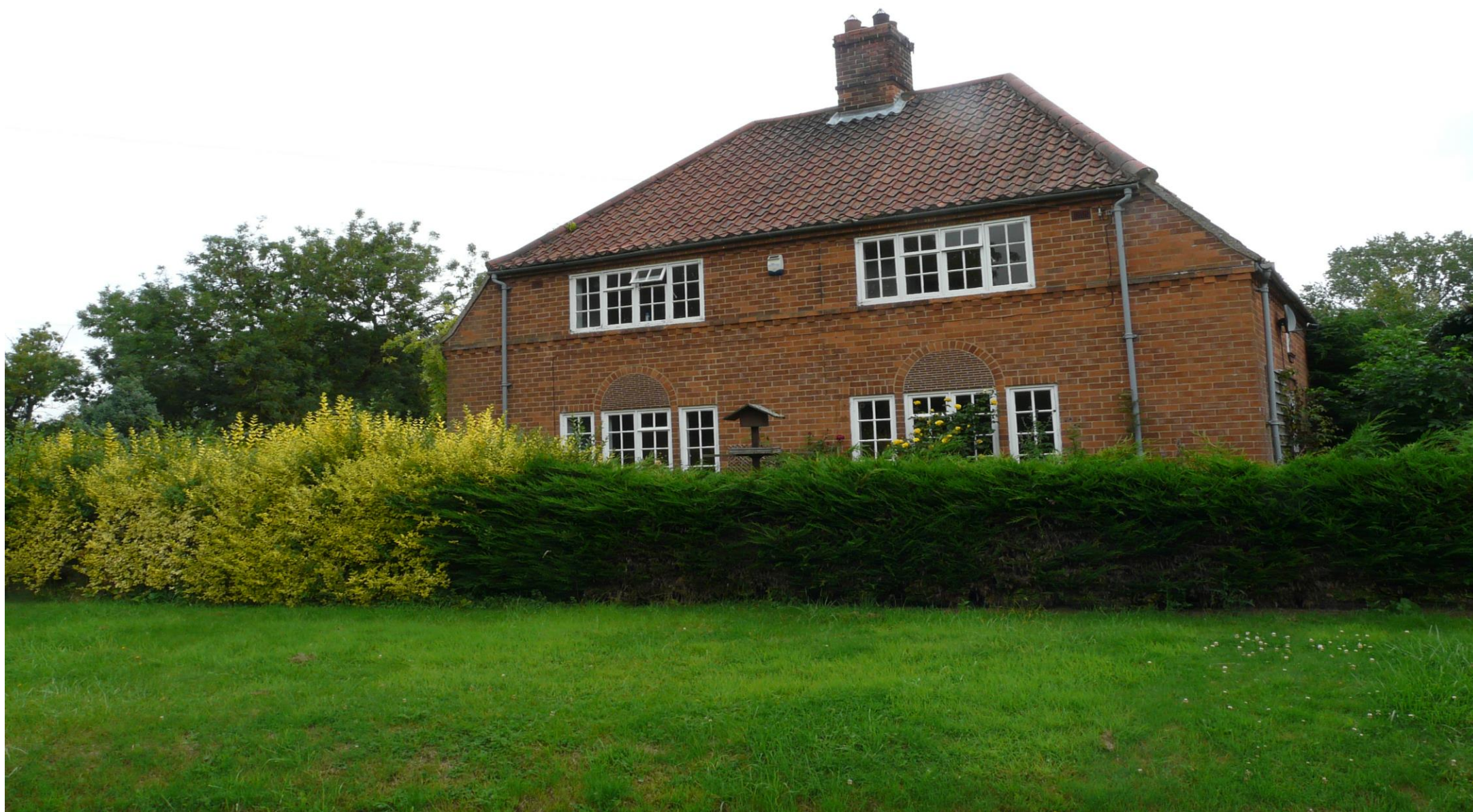
SEVER COTTAGE, HOWE, YO7 4HU £695 per month*