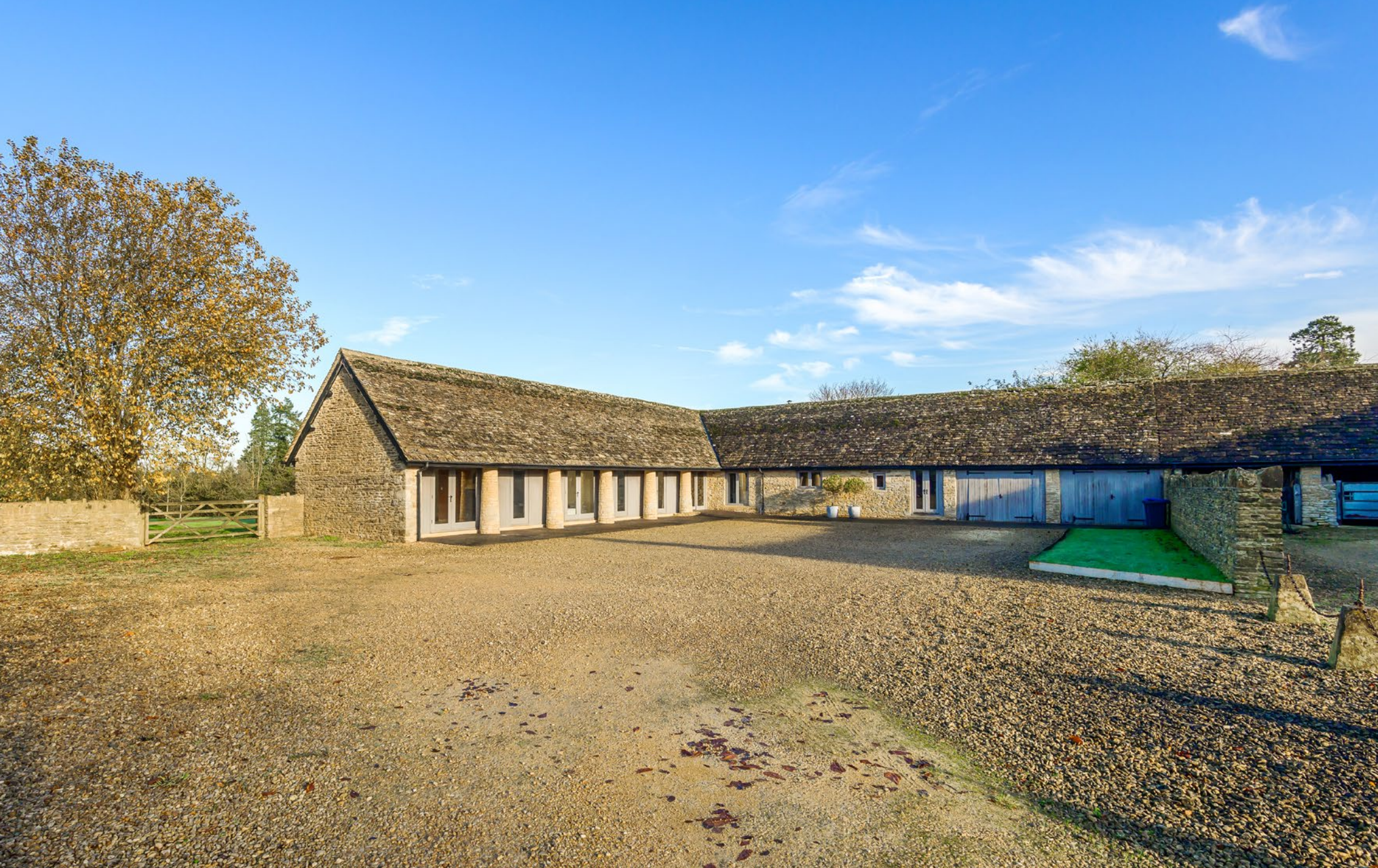
THE MANOR BARN Sevington