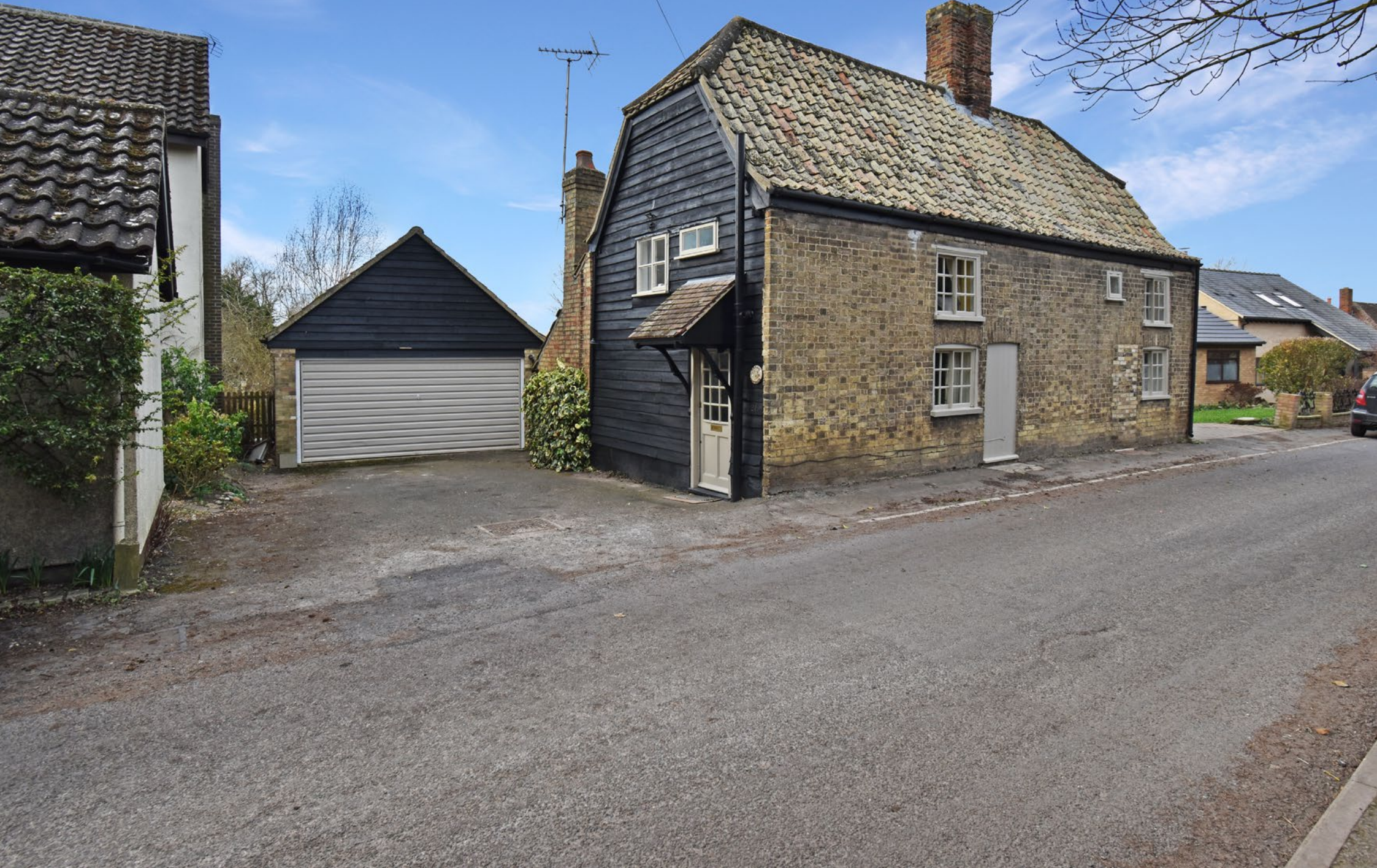
GRASSEY COTTAGE 21 Green End, Fen Ditton