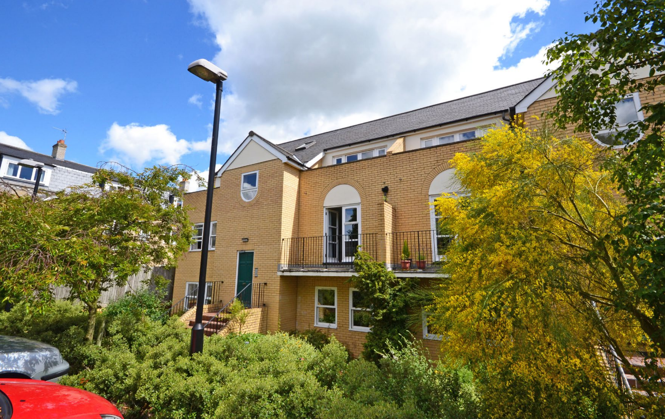
88 YORK TERRACE Cambridge