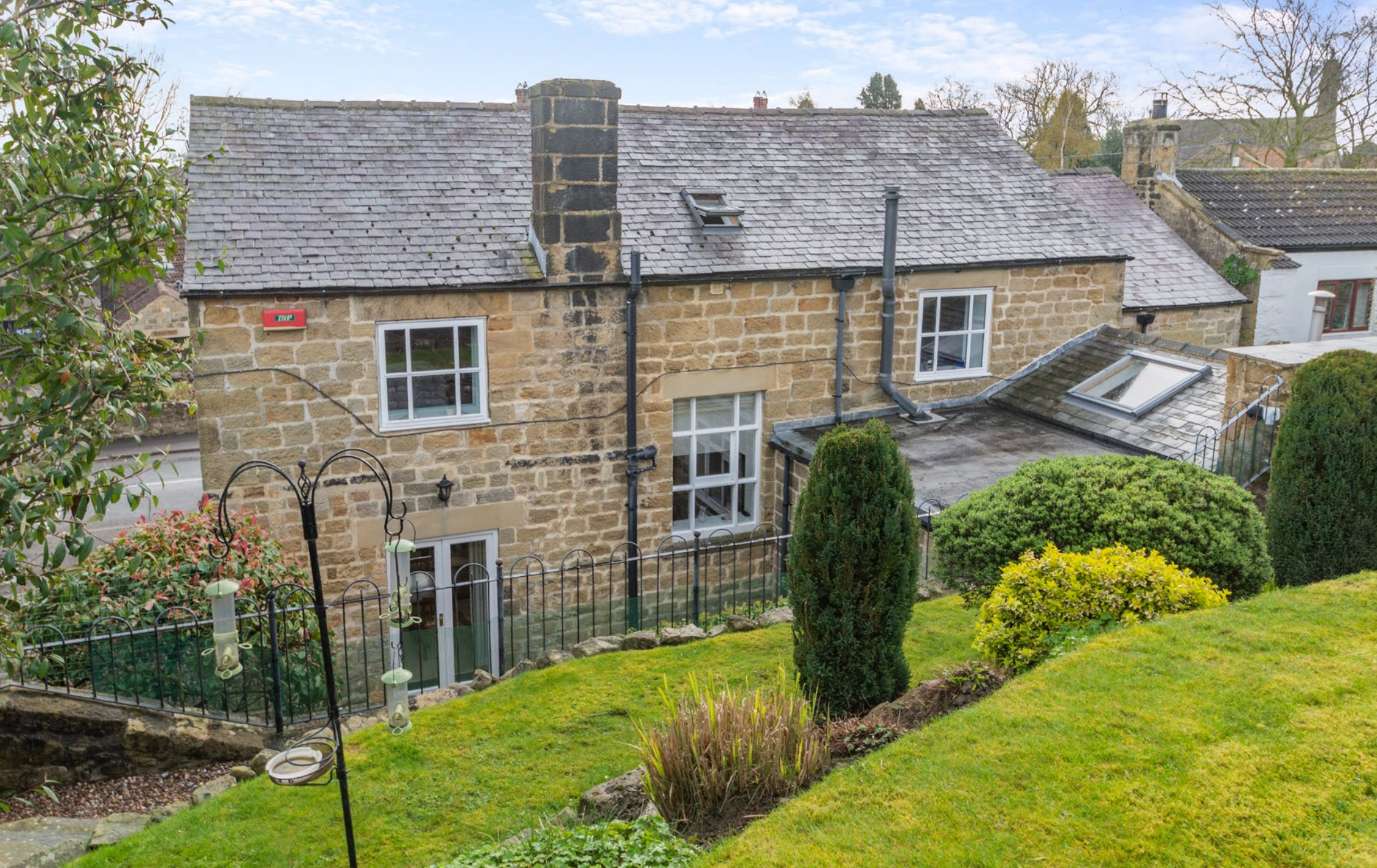
THE OLD SCHOOL Grewelthorpe, Near Ripon