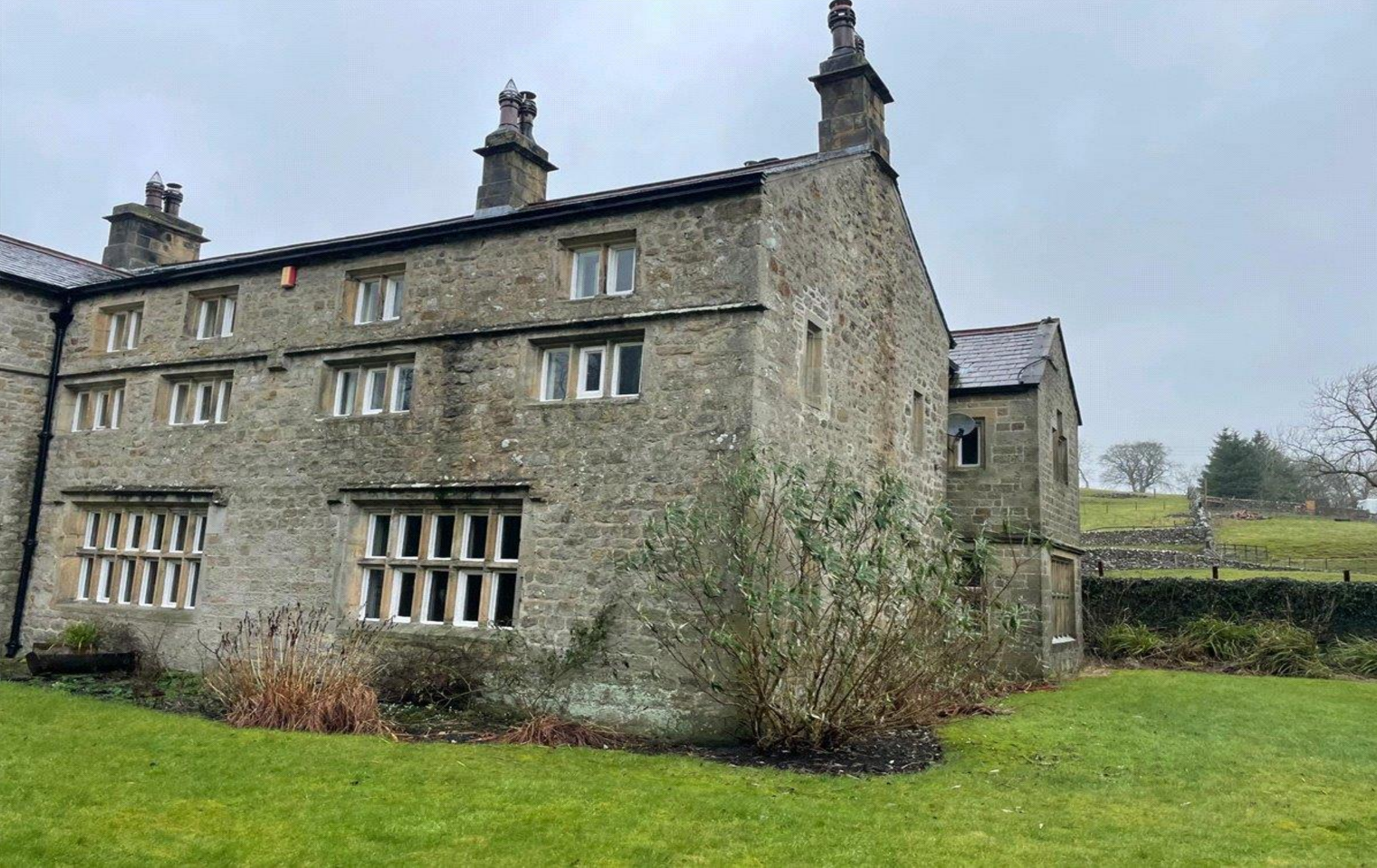
GLEBE COTTAGE, KIRKBY MALHAM, SKIPTON, NORTH YORKSHIRE, BD23 £1,000 per month