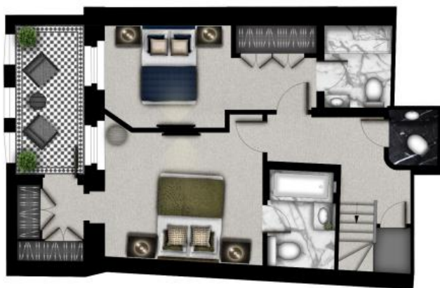
COURT YARD LEVEL