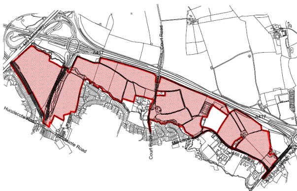
Perrybrook, Brockworth Site Location Plan