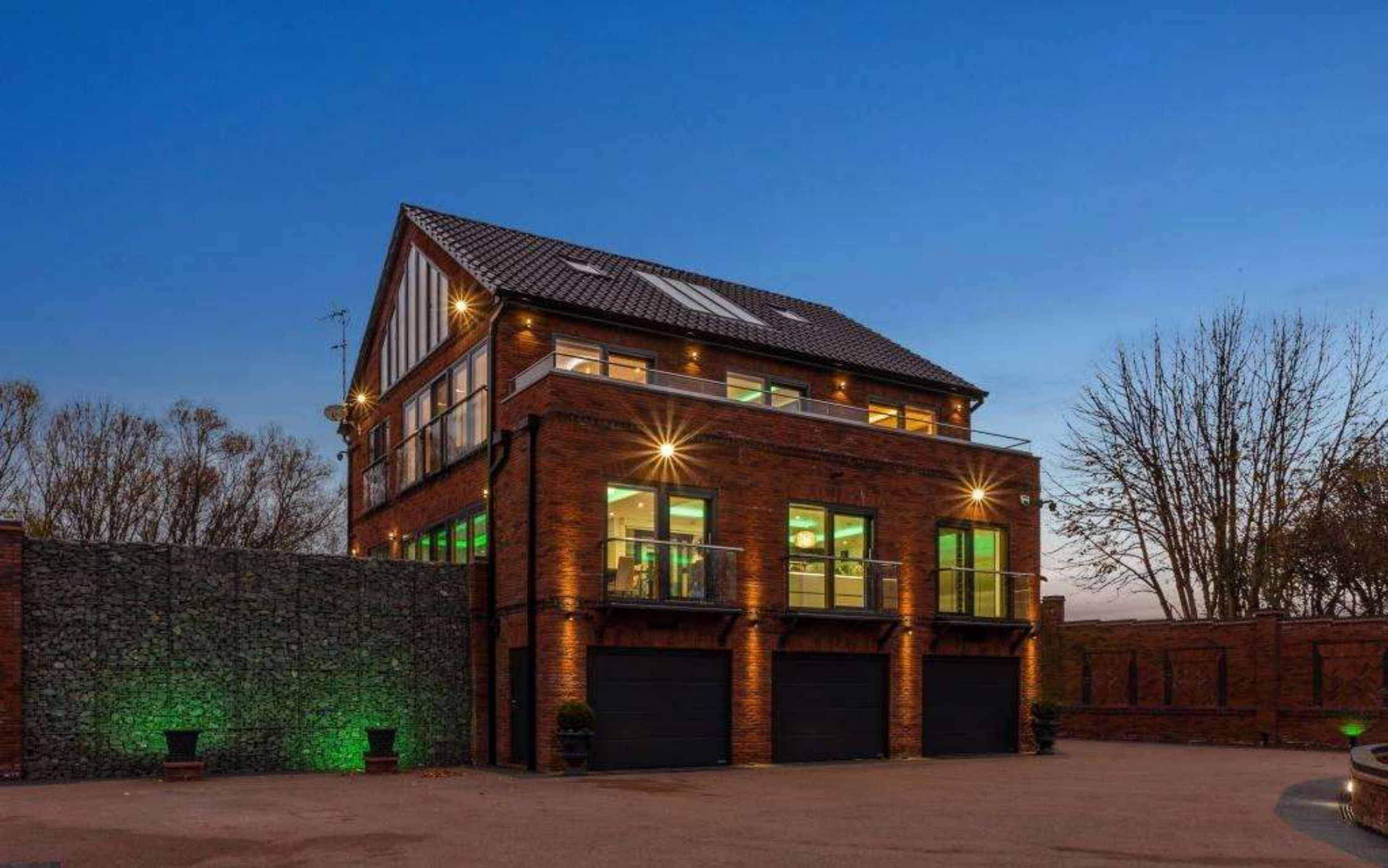
LOCK BRIDGE HOUSE, CLAYBRIDGE, SYKEHOUSE, DN14 9AL £1,400,000