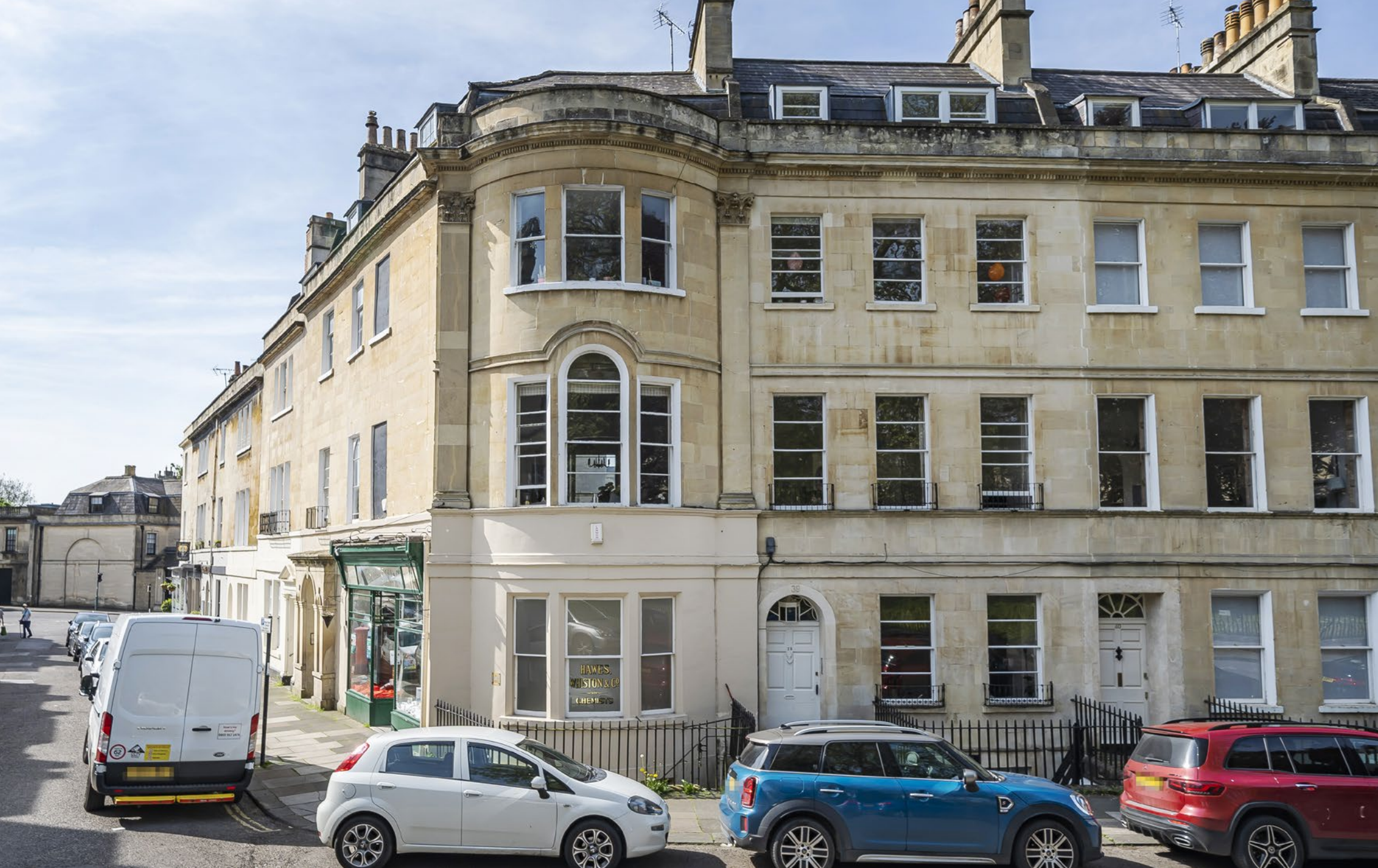
38 ST. JAMES'S SQUARE Bath