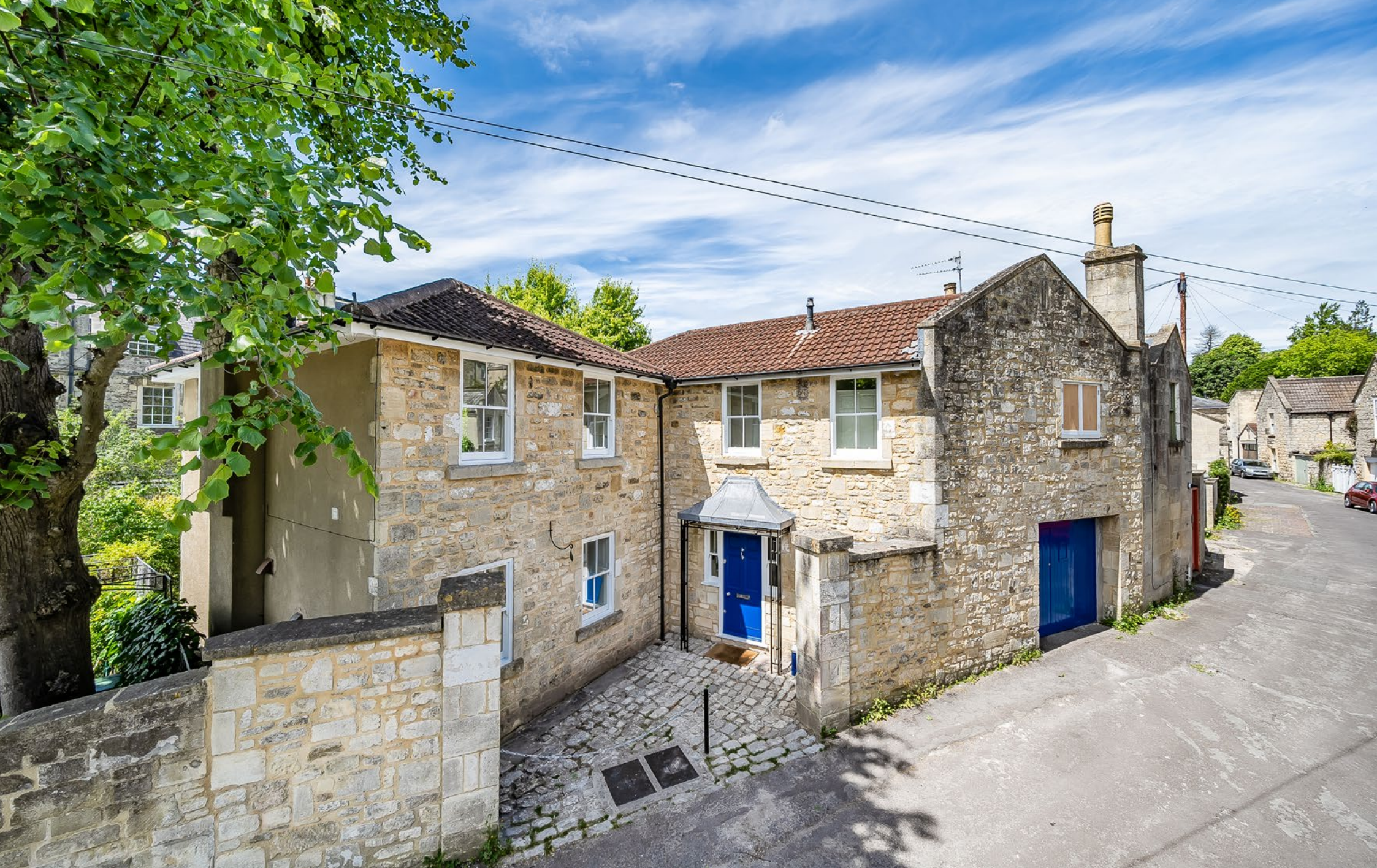
6 UPPER LANSDOWN MEWS Bath