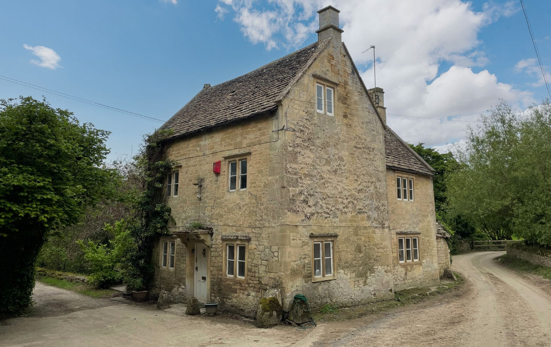
DREWETTS MILL COTTAGE Corsham