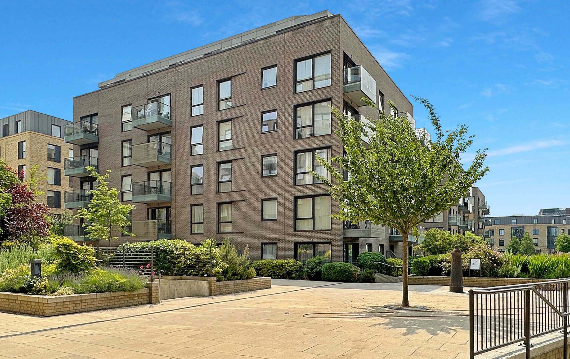
9 WATSON HOUSE 4 Mill Park, Cambridge