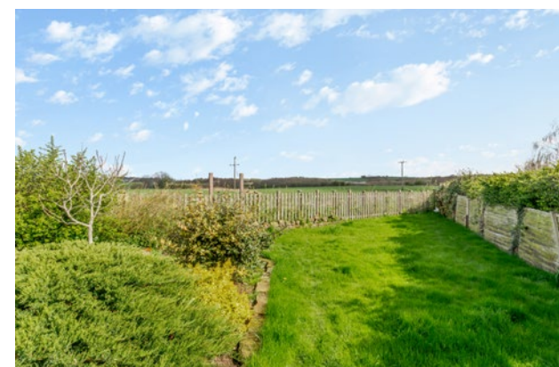
HEATHER COTTAGE Cold Hiendley