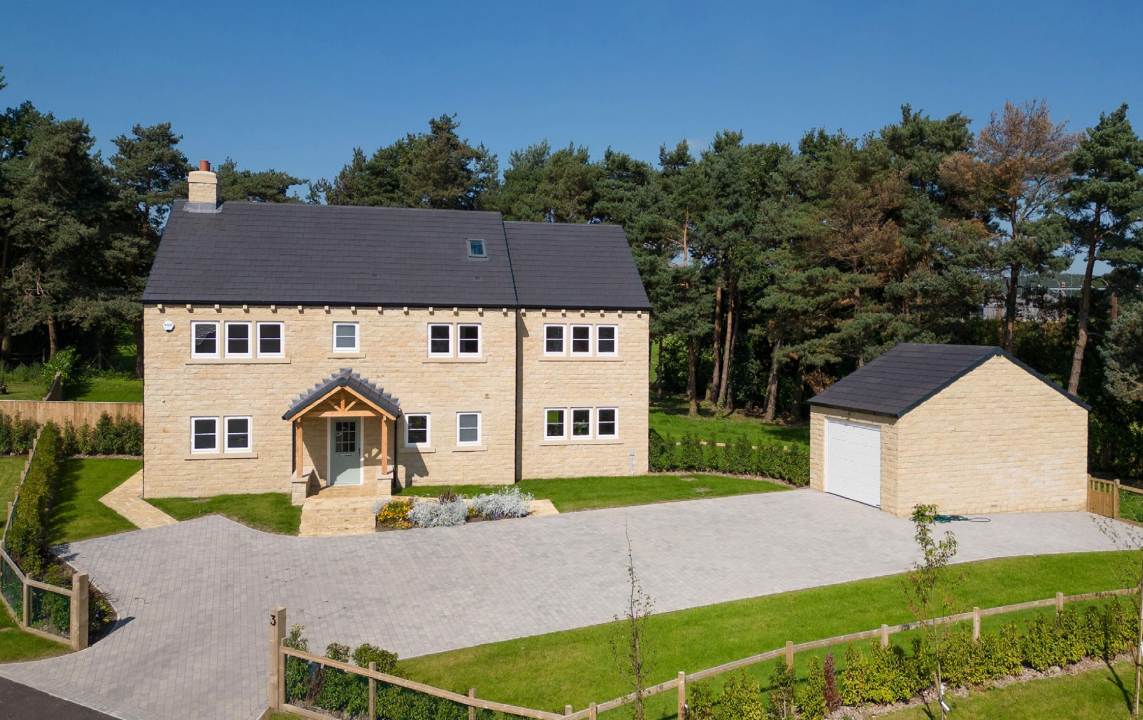
3 WHARFEDALE GARDENS Dunkeswick, Near Harrogate