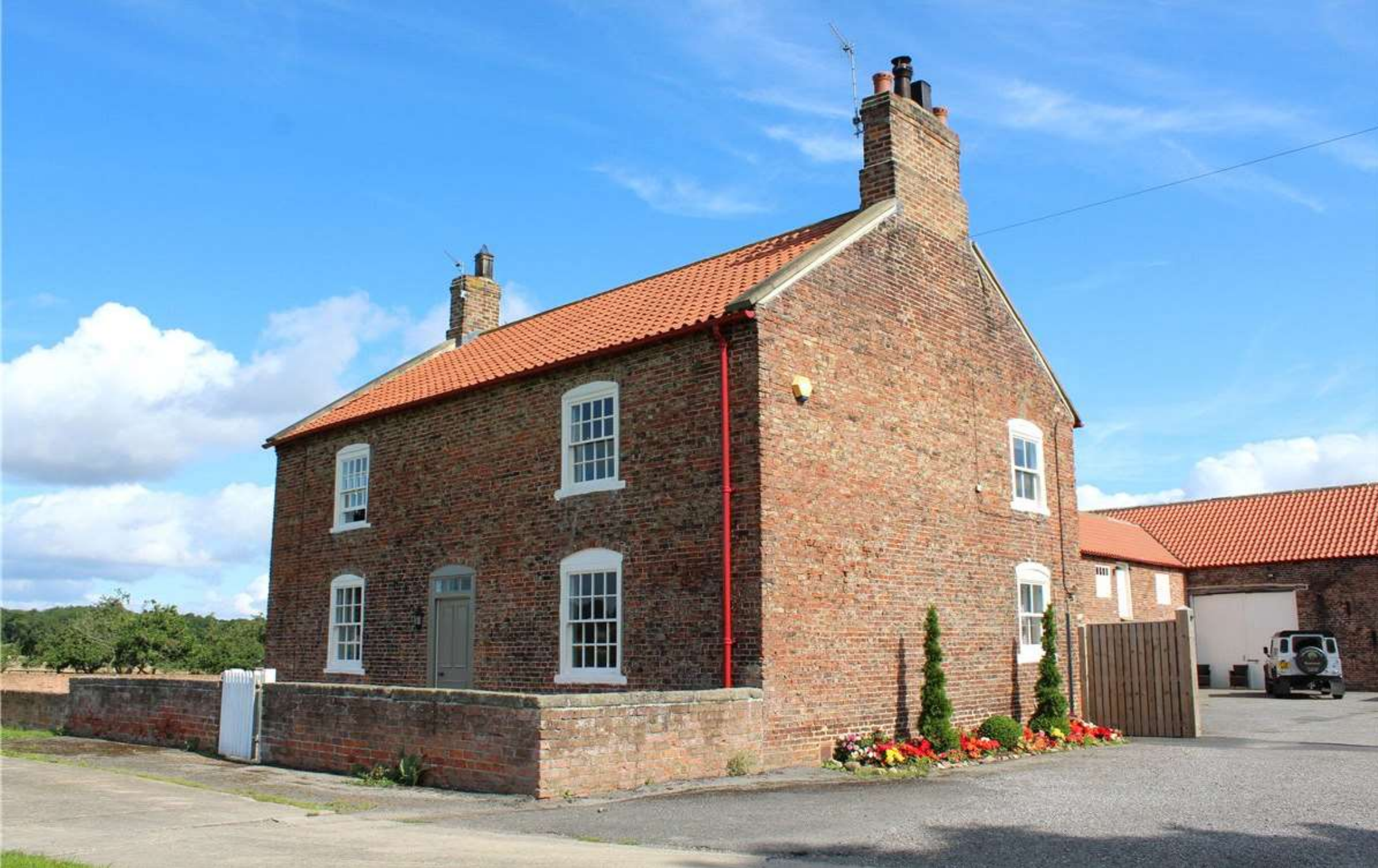
OATLANDS FARMHOUSE, WALSHFORD, WETHERBY, NORTH YORKSHIRE, LS22 5JH £2,650 per month