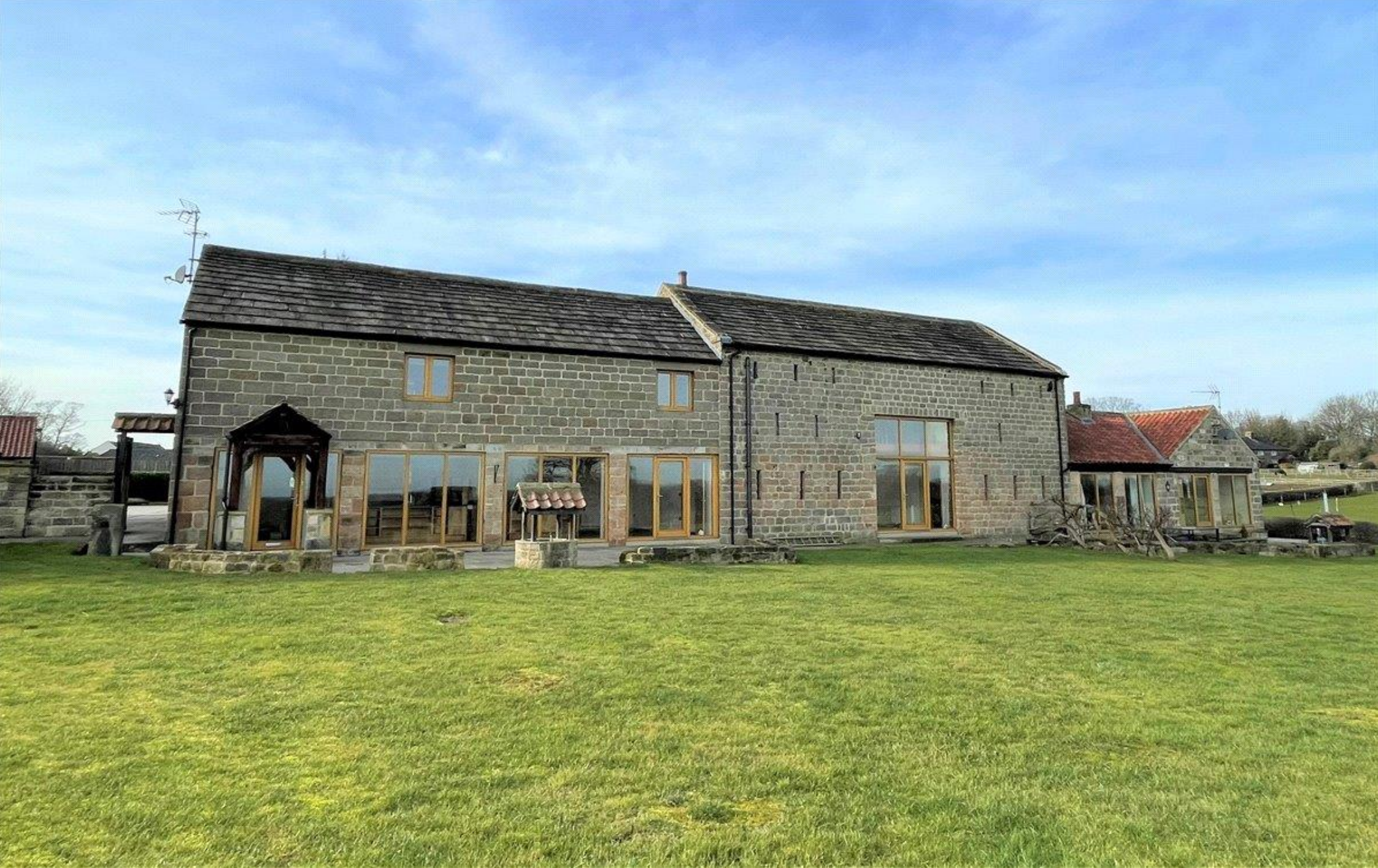
THE BARN, THISTLE HILL FARM, THISTLE HILL, KNARESBOROUGH, HG5 8LS £2,995 per month