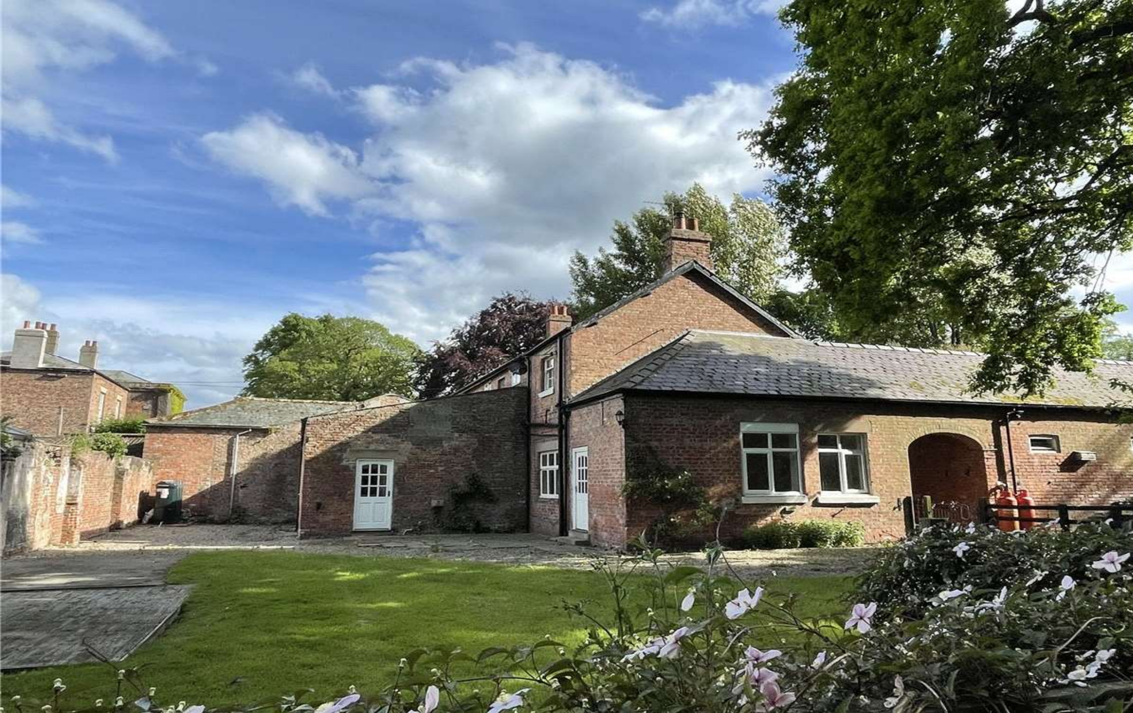
STABLE COTTAGE, KIRKLINGTON, BEDALE, NORTH YORKSHIRE, DL8 2LS £1,250 per month