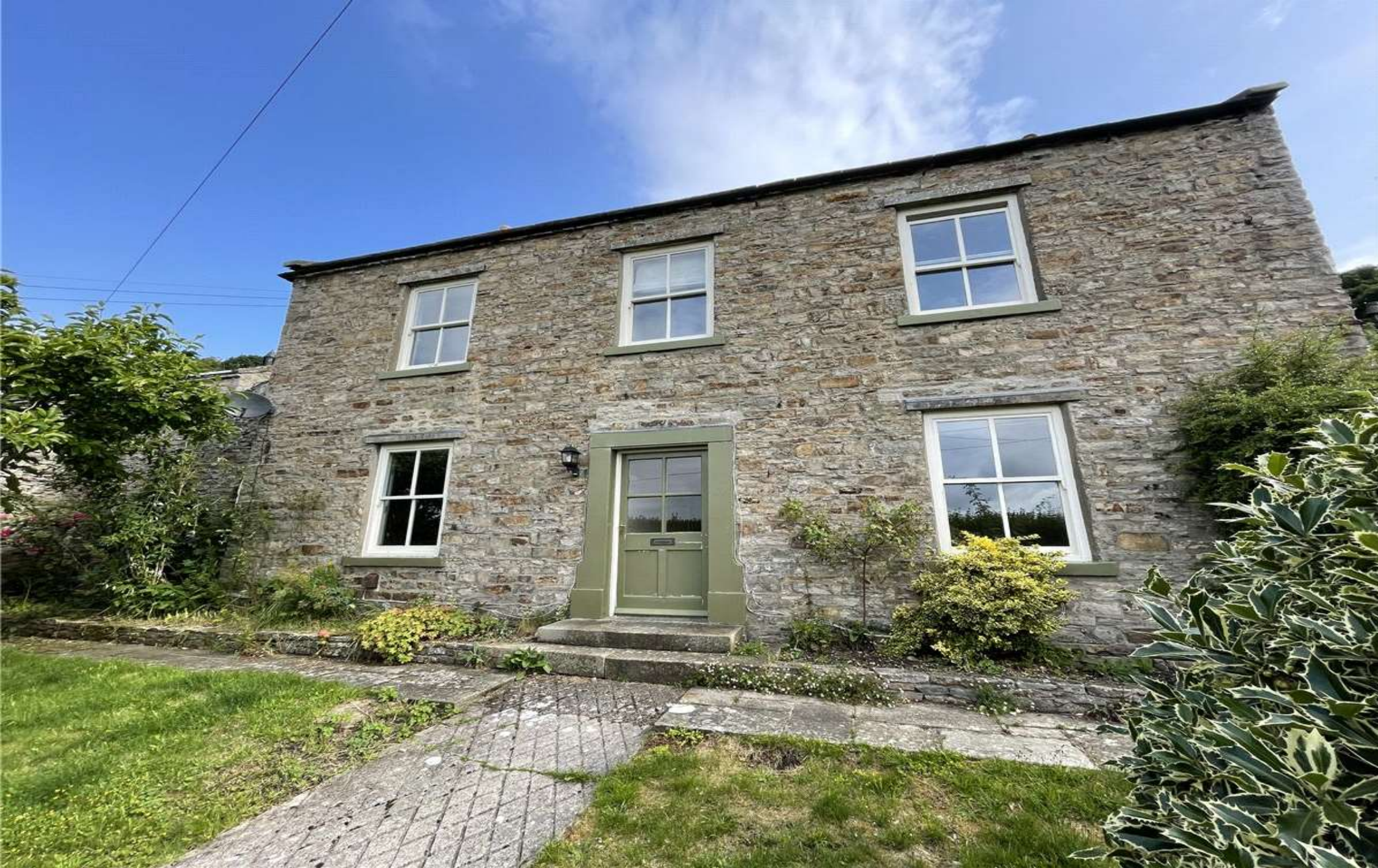
PRESTON MOOR FARMHOUSE, PRESTON UNDER SCAR, LEYBURN, DL8 4AJ £2,350 per month