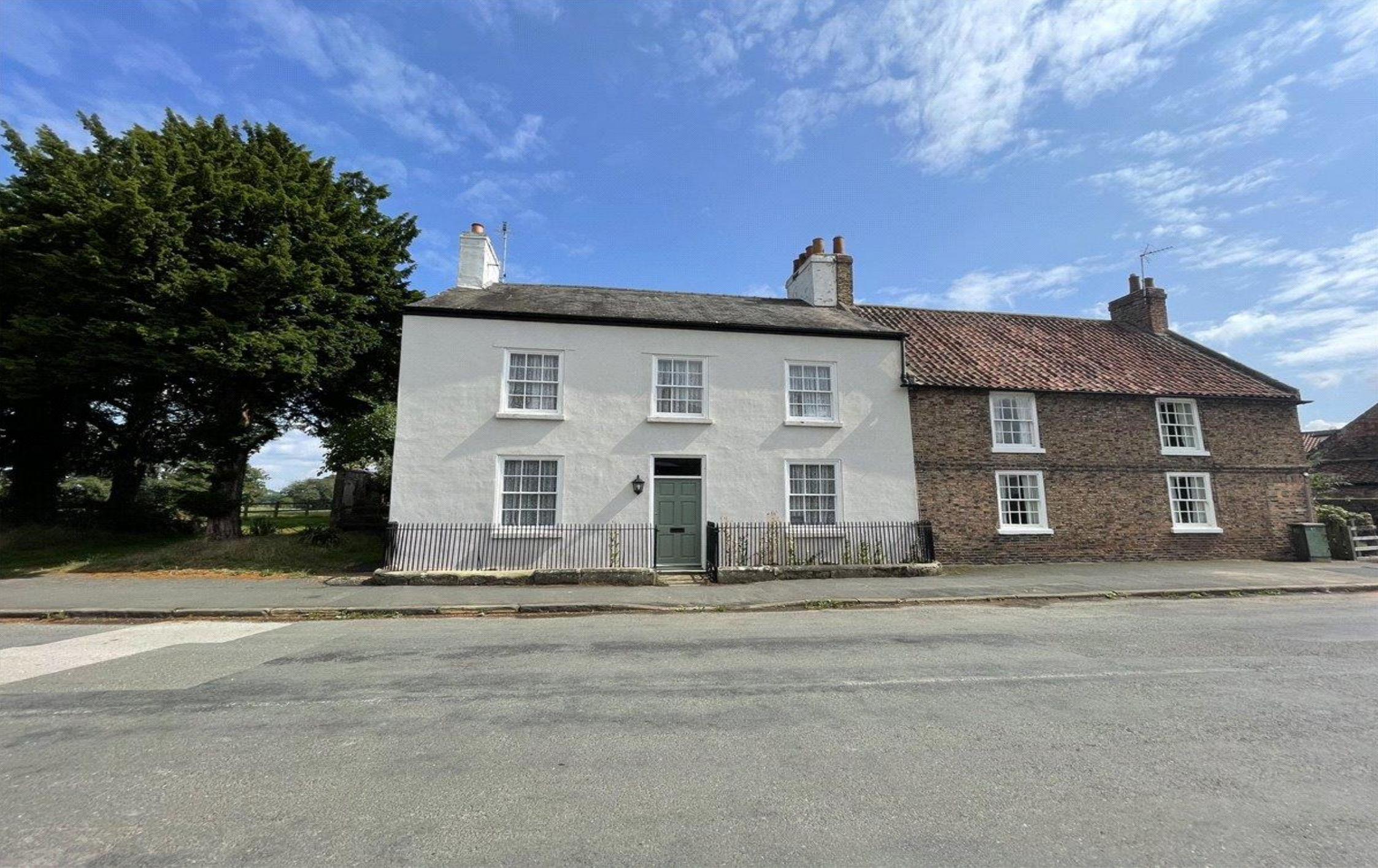
MANOR FARMHOUSE, ALDBOROUGH, YORK, NORTH YORKSHIRE, YO51 9EP £2,500 per month