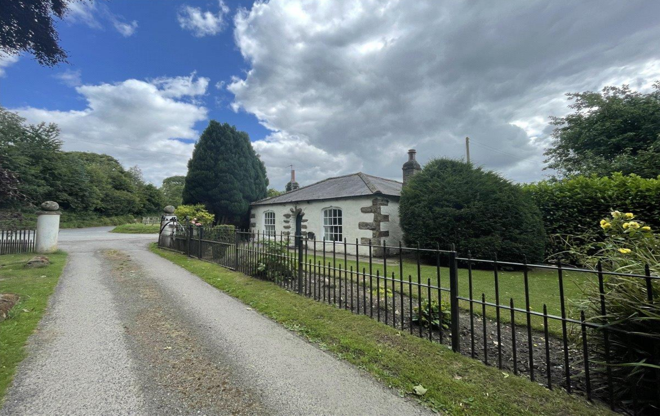
AZERLEY LODGE, AZERLEY, RIPON, NORTH YORKSHIRE, HG4 3JJ £800 per month