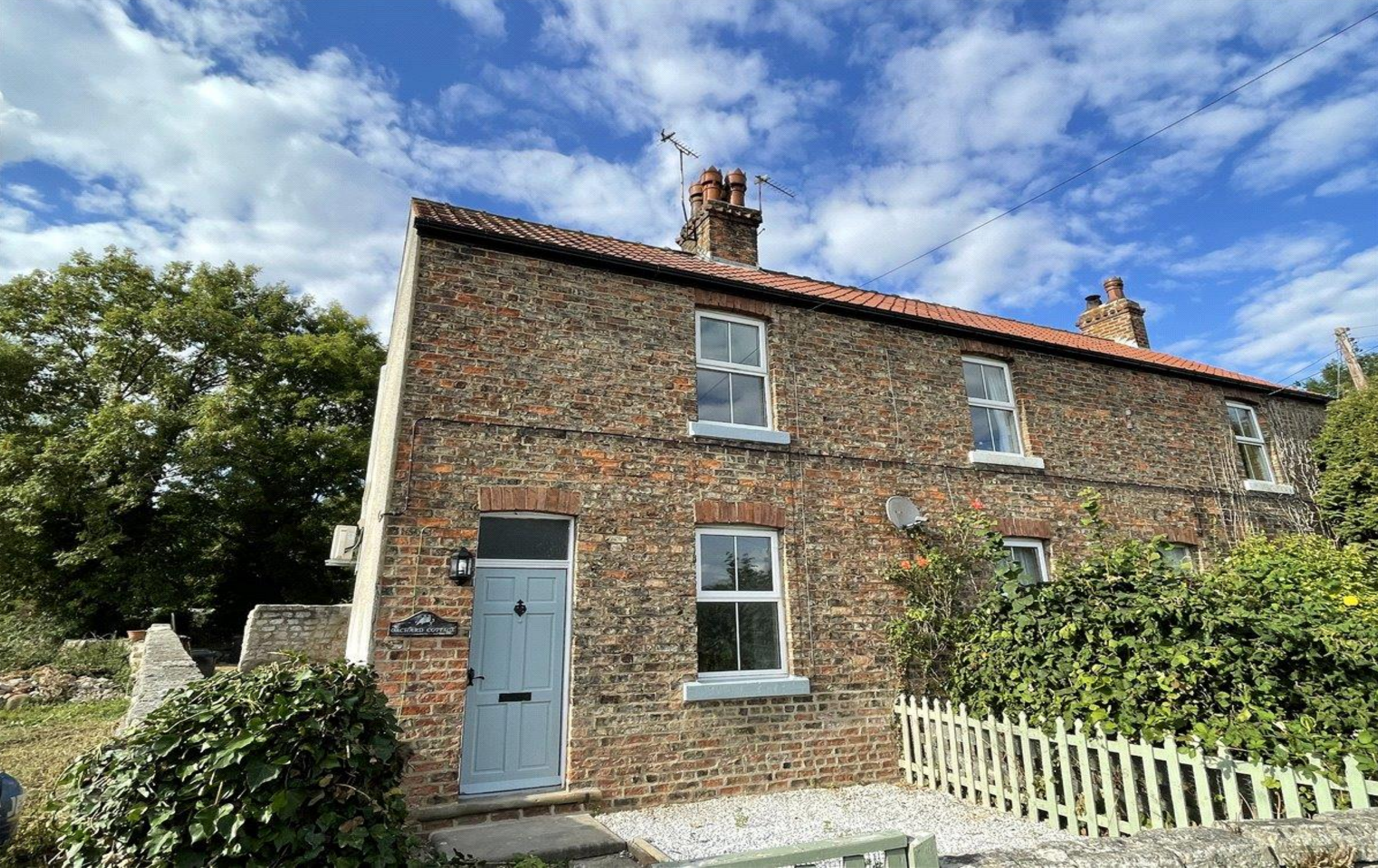
ORCHARD COTTAGE, LITTLETHORPE, RIPON, NORTH YORKSHIRE, HG4 3LW £750 per month