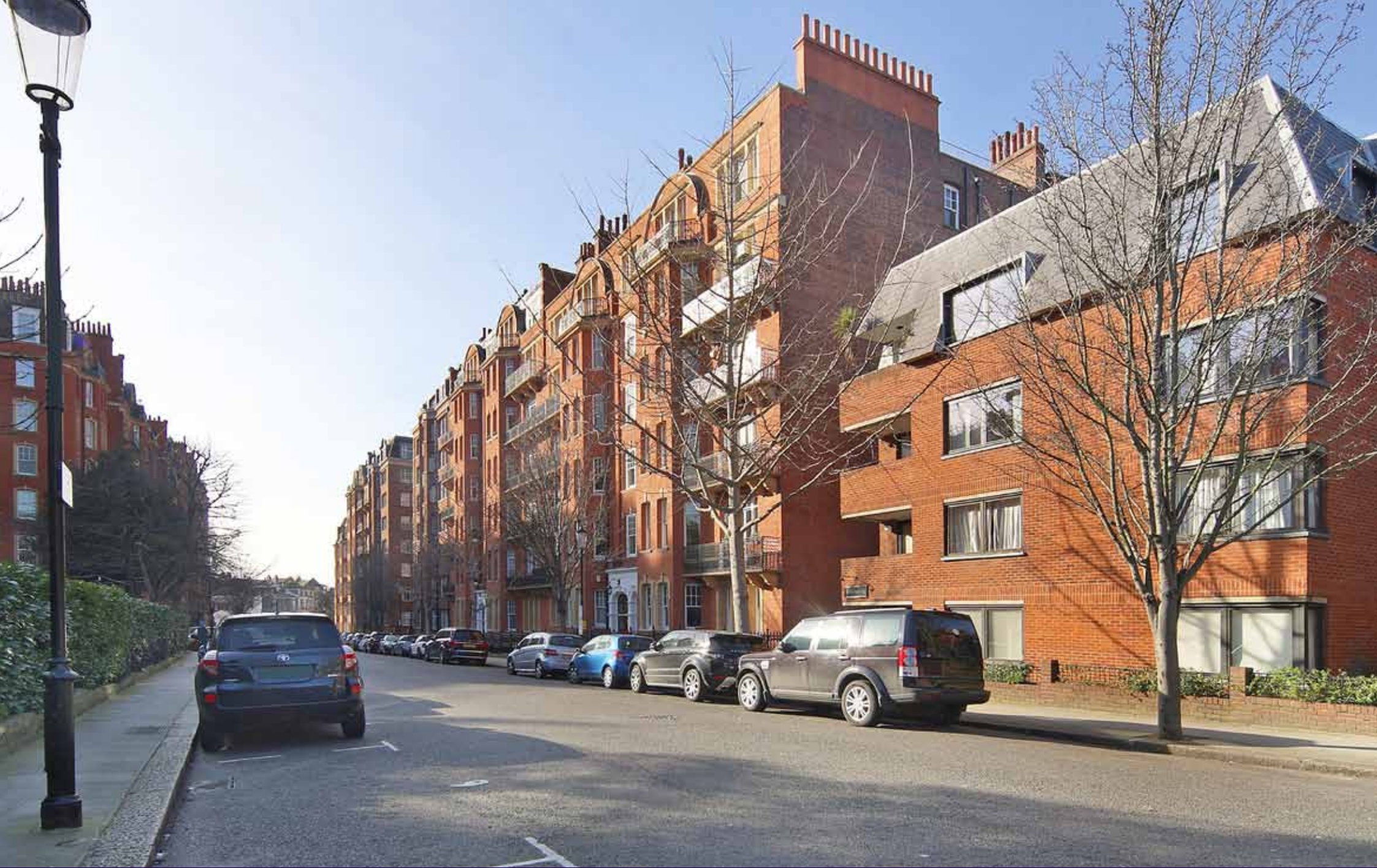
OAKWOOD COURT Holland Park