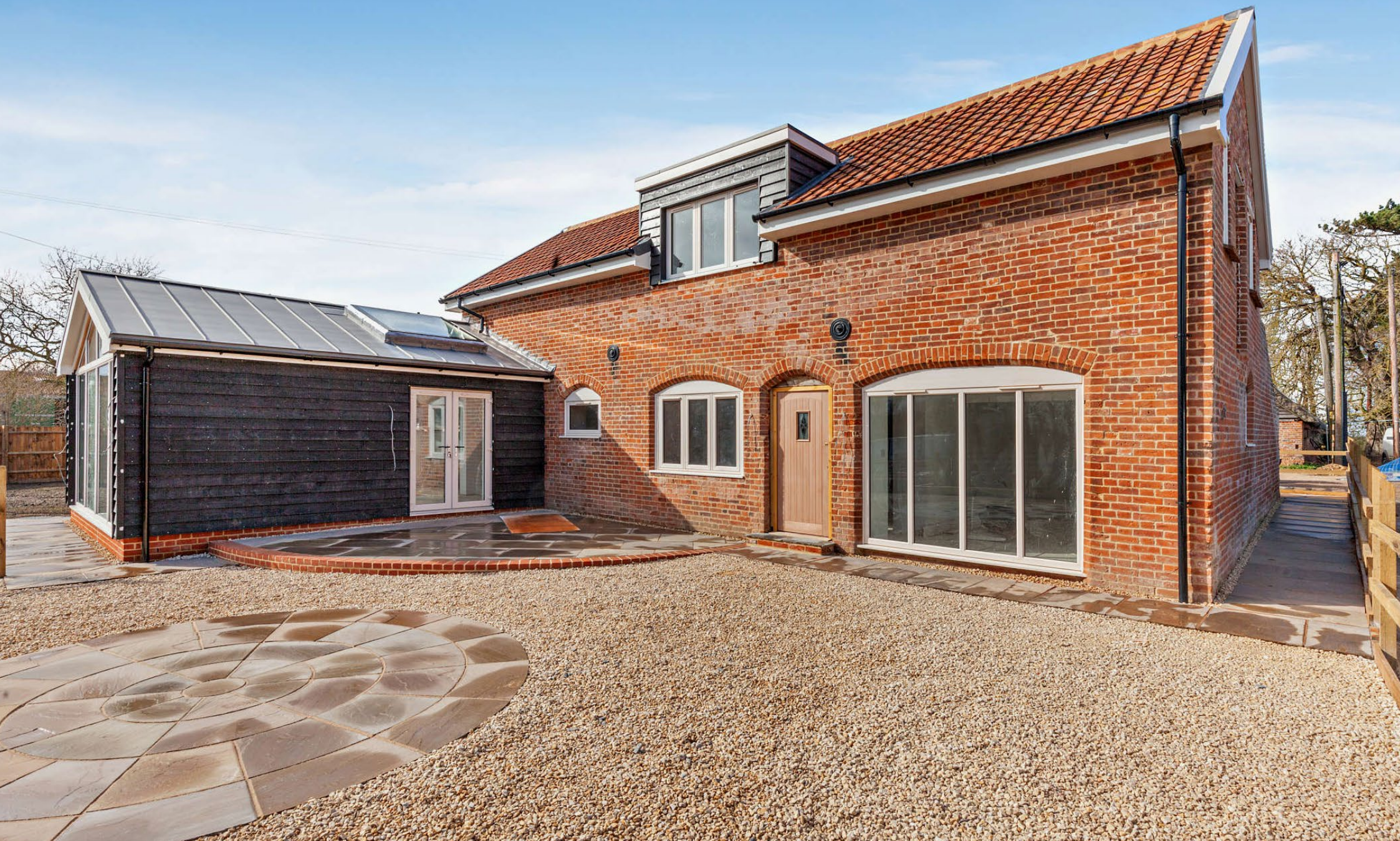
THE GRANARY Nr Lavenham, Suffolk