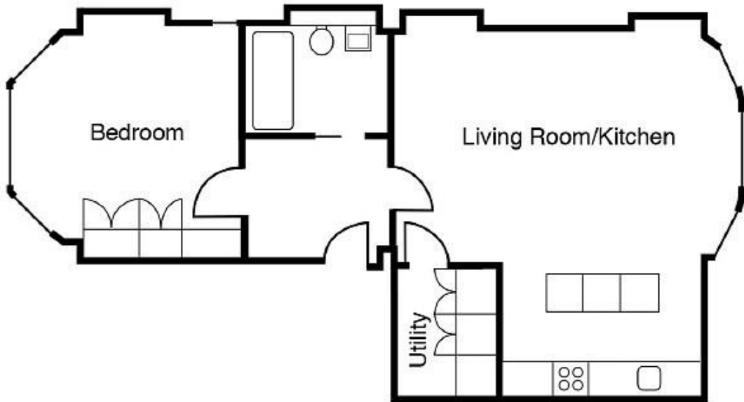
Apartment 5 Second Floor 653 sq ft / 61 sq m

Mayfair Lettings 020 7493 0676 mayfair@carterjonas.co.uk 18 Davies Street, London, W1K 3DS