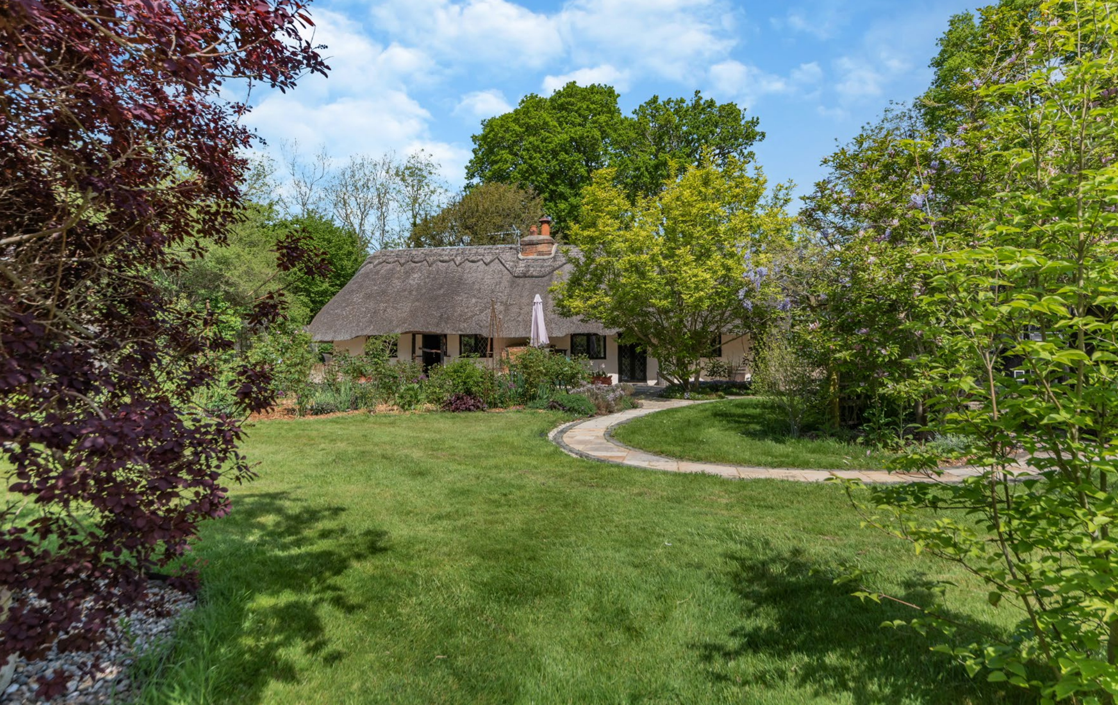
PAMBER FOREST HOUSE Guide Price £650,000