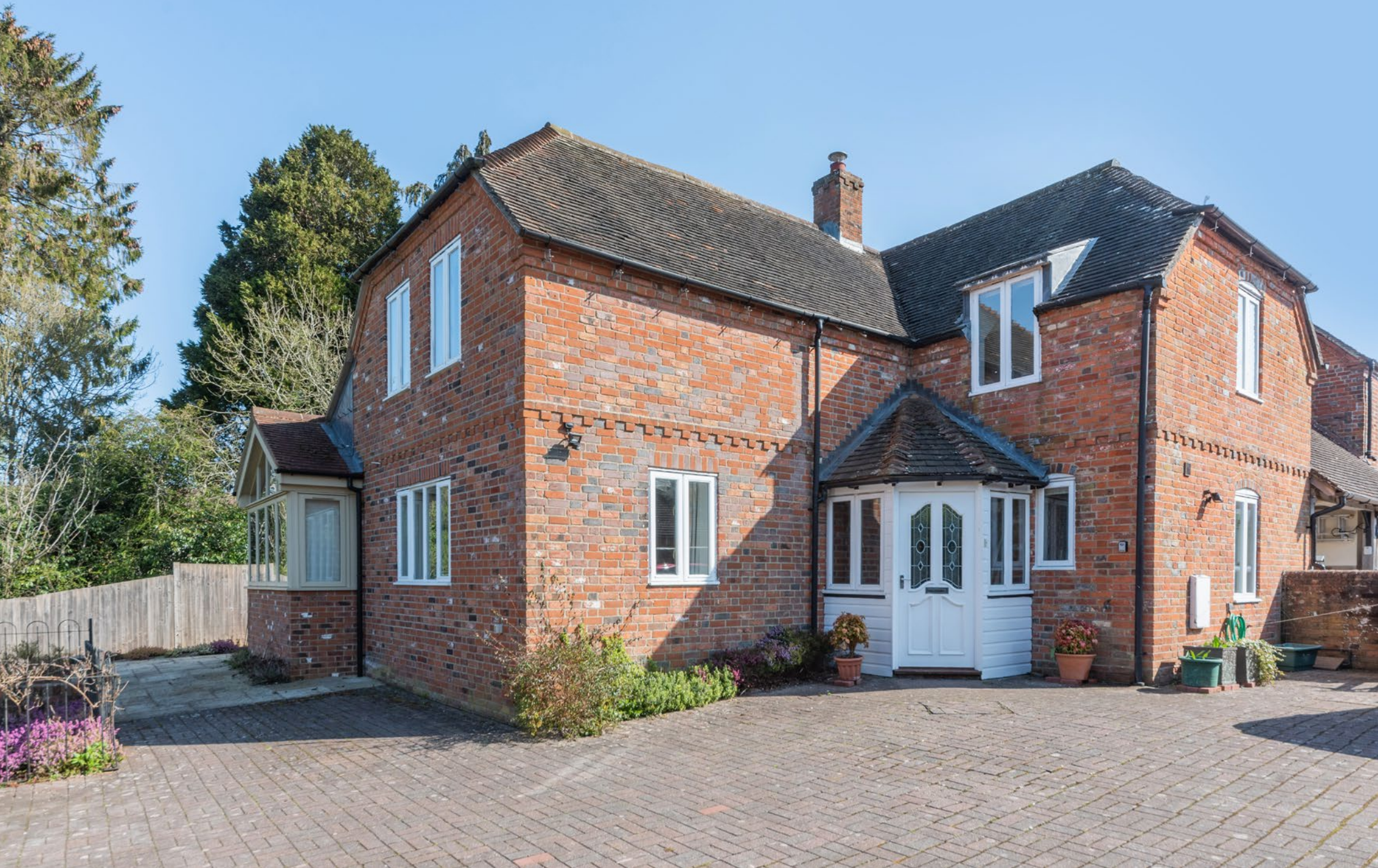
MULBERRY HOUSE Guide Price £975,000