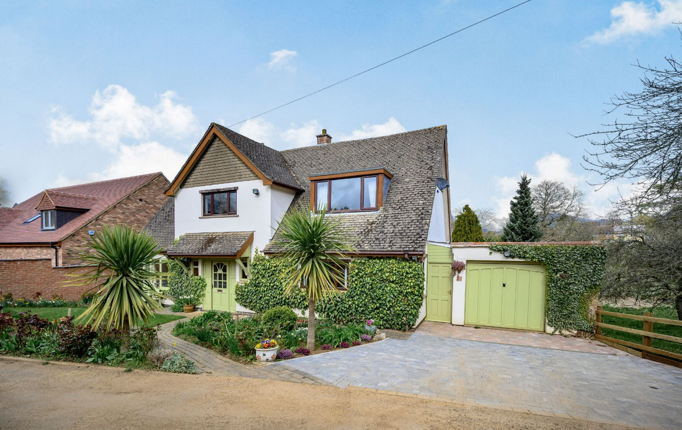
MEADOW VIEW Pitsford, Northamptonshire