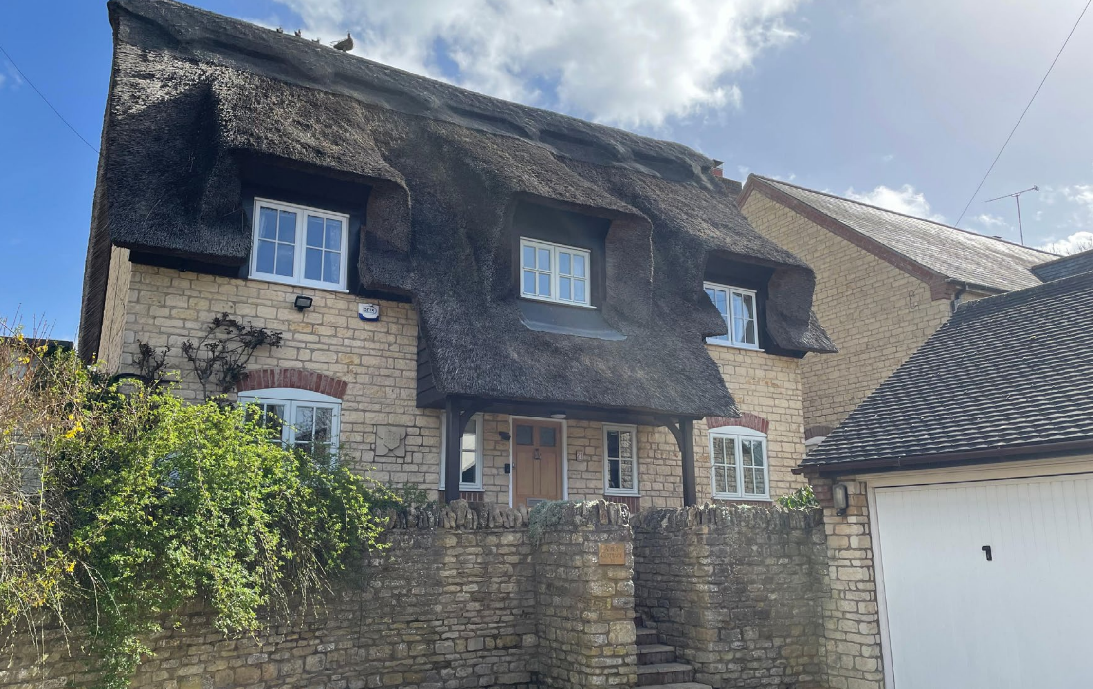
ABBEY COTTAGE Silverstone, Northamptonshire