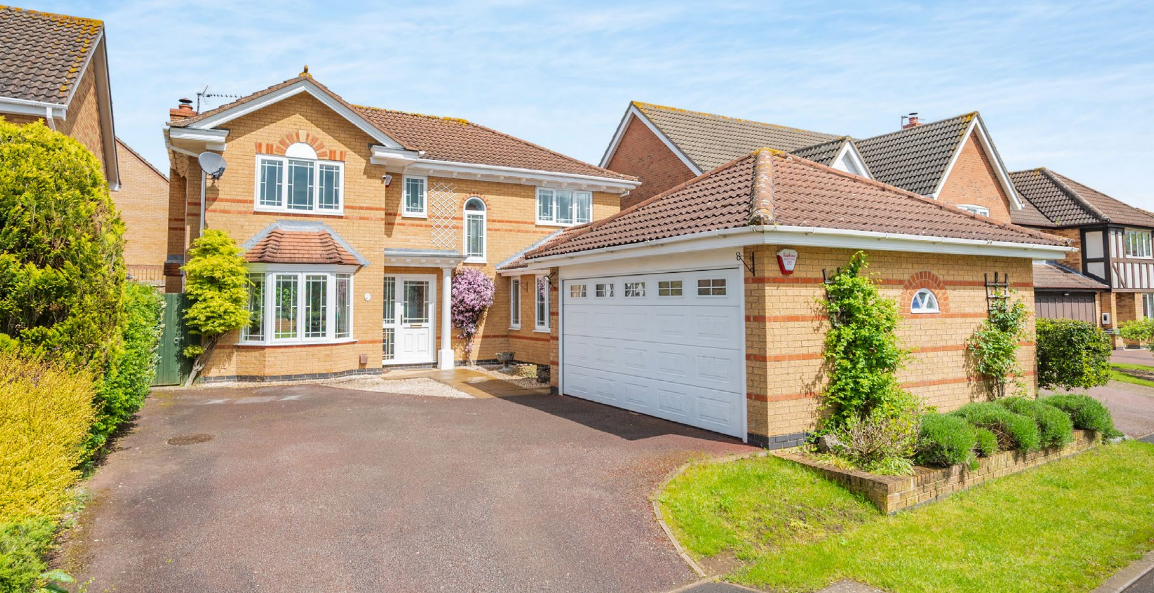
15 FAR BROOK Brixworth, Northamptonshire