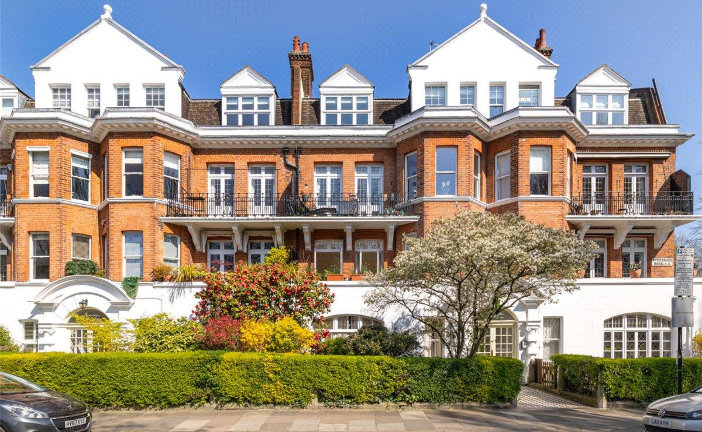
BISHOPS MANSIONS, STEVENAGE ROAD, SW6 £1,150,000