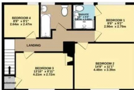
1ST FLOOR 625 sq. ft. (58.1 sq. m.) approx.