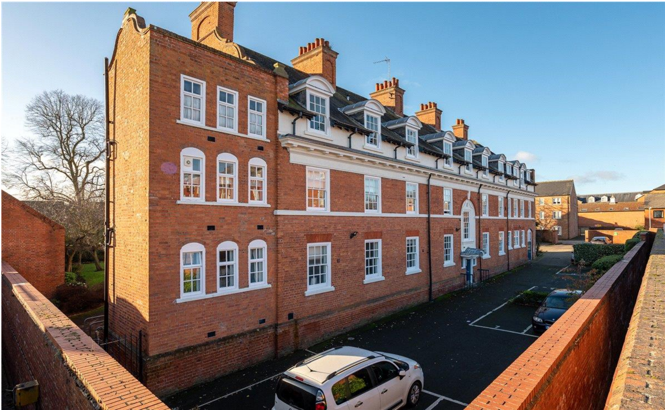
13 FEVERSHAM HOUSE, JEWBURY, YORK £190,000