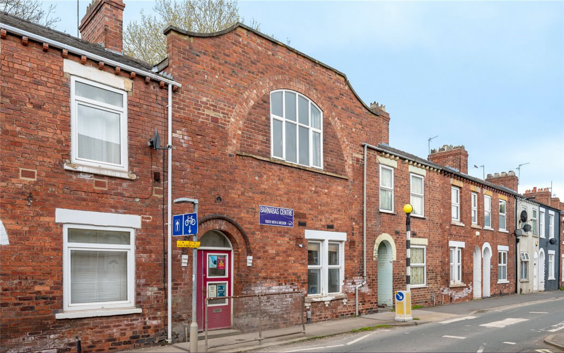
BARNABAS CENTRE, SALISBURY TERRACE, YORK £225,000