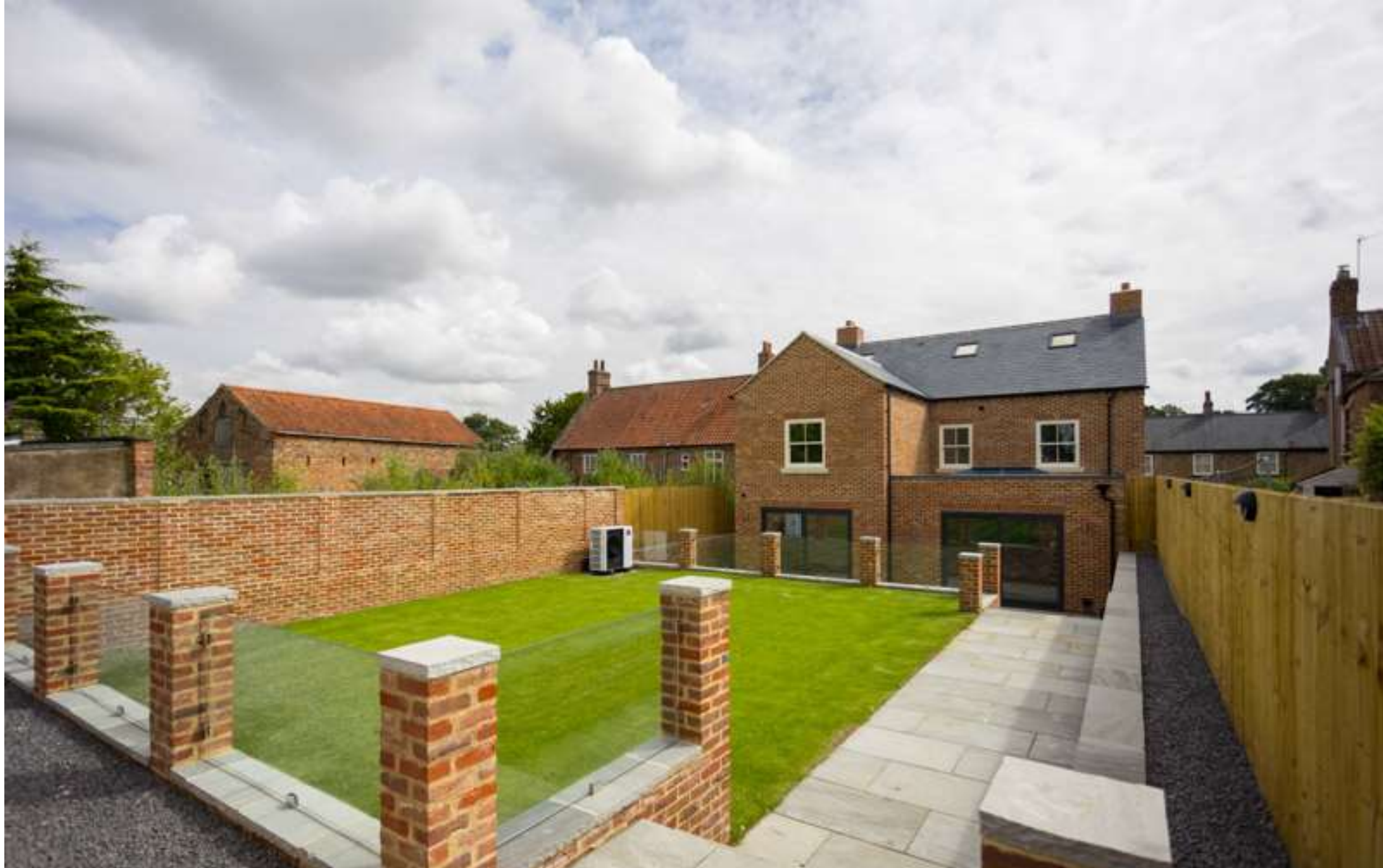
TRINITY HOUSE, MAIN STREET, HOLTBY £975,000