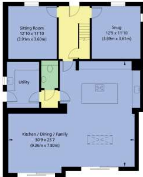
Ground Floor GROSS INTERNAL FLOOR AREA APPROX. 1251 SQ FT / 116.23 SQ M