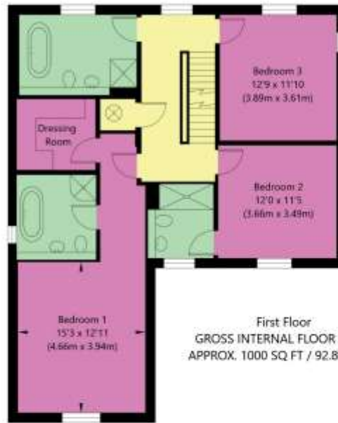
First Floor GROSS INTERNAL FLOOR AREA APPROX. 1000 SQ FT / 92.89 SQ M