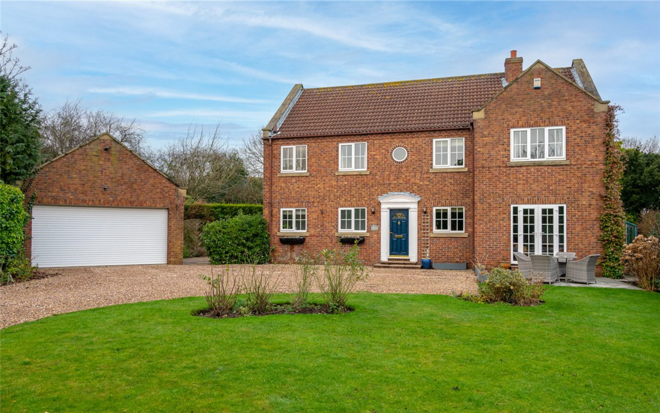
HYTHE HOUSE, MILL LANE, ACASTER MALBIS £925,000