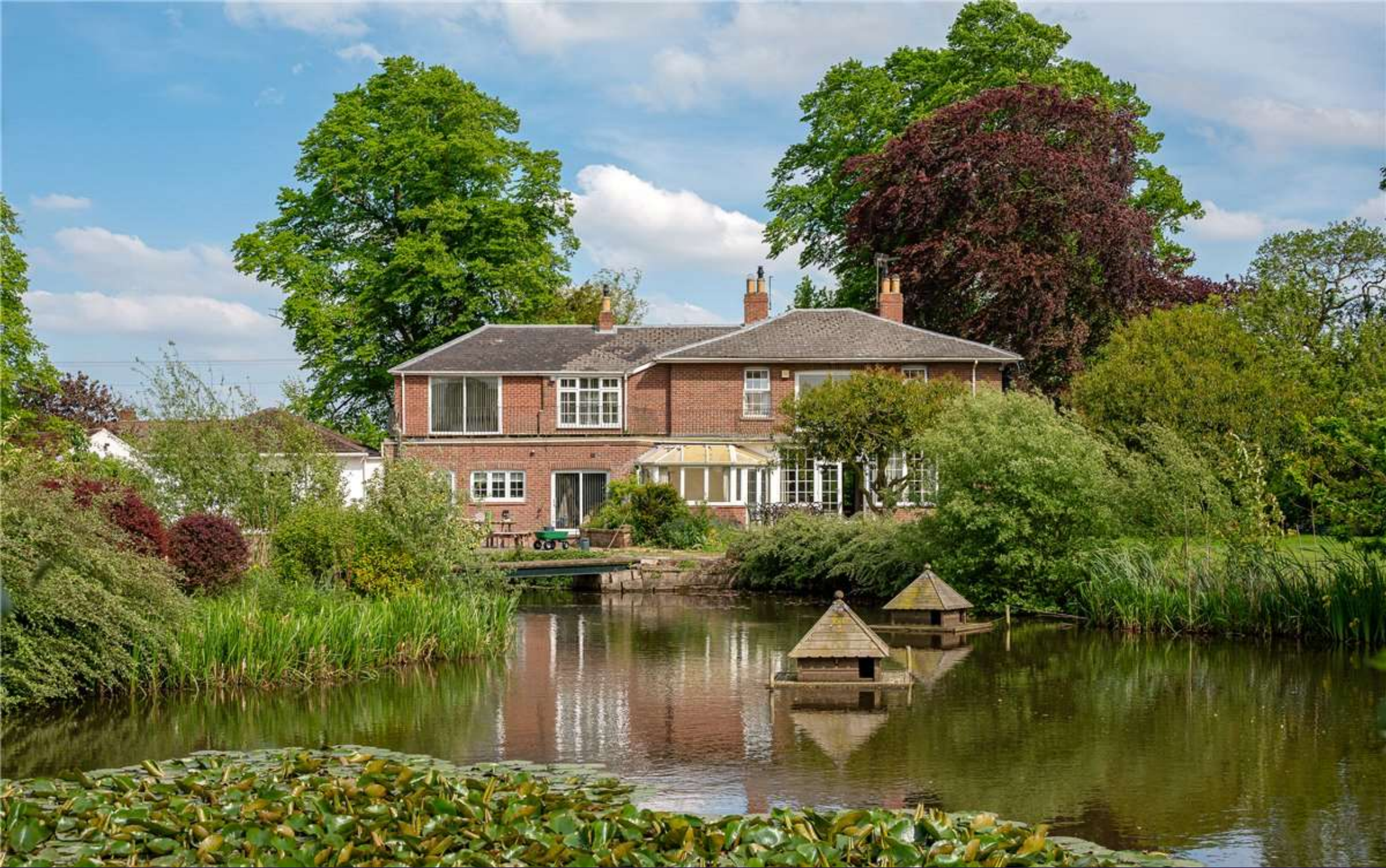
AUGHTON LODGE, AUGHTON, YORK £1,100,000