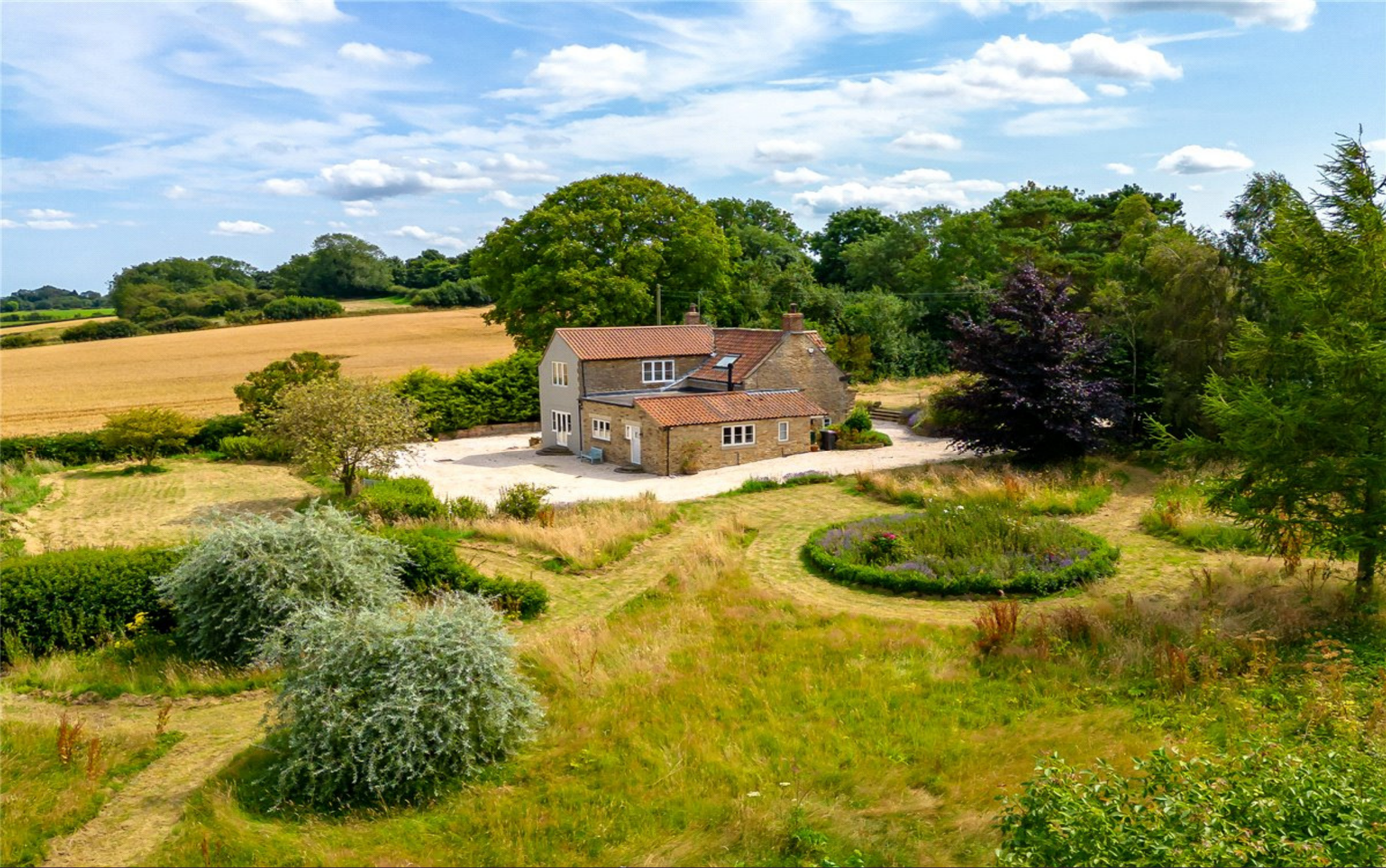
FLATT TOP COTTAGE, TERRINGTON, YORK £715,000