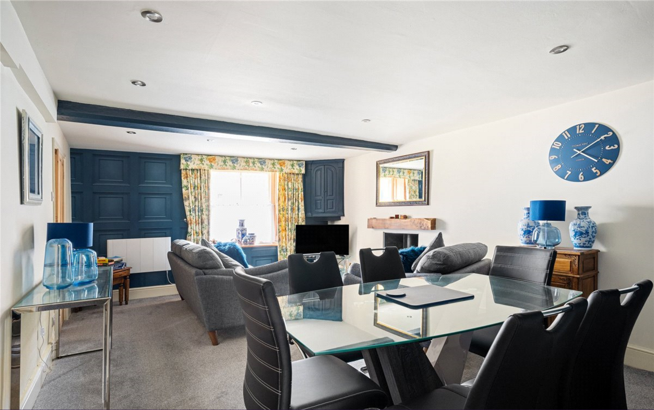
BOATHOUSE COTTAGE, STAITHES £460,000