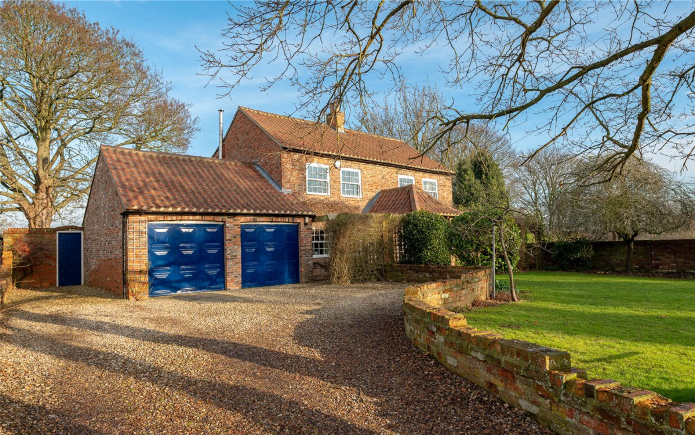
THE COTTAGE, ANGRAM, YORK Offers in the region of £725,000