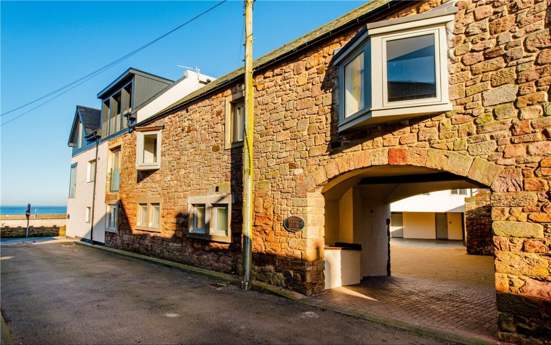
CRAGG END, FARNE HOUSE £355,000