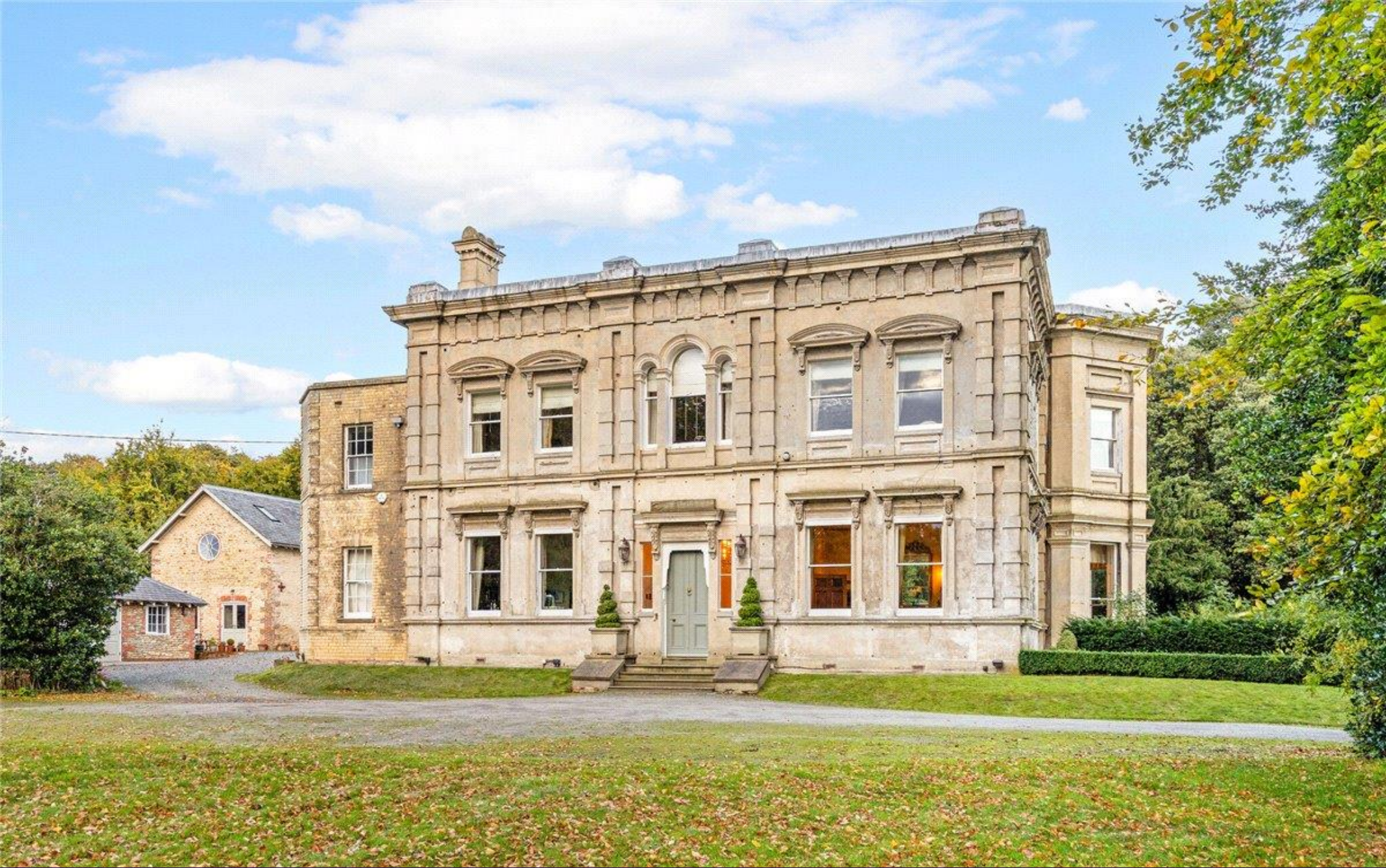
CLEATHAM HALL, CLEATHAM £1,500,000