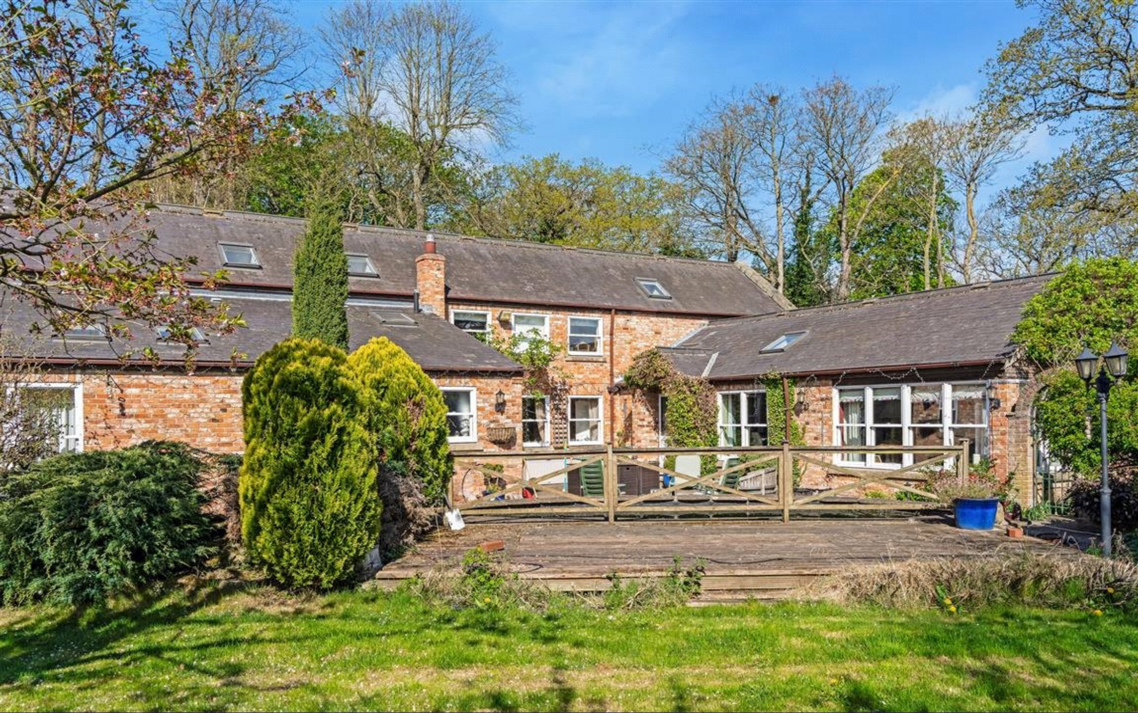
THE HALL LODGE, SCHOOL ROAD, HEMINGBROUGH £780,000